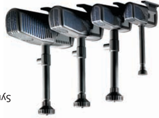
Synkra Silent Pump