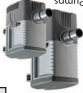
Synkra Dirty Water Pumps